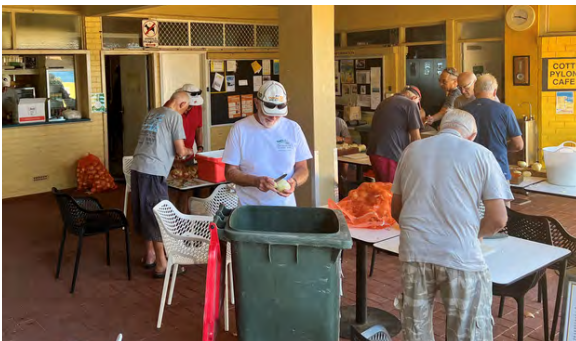
The Great Onion Cut

The Cott Café is continuing to be supported by Vet members to fulfil the duties in servicing those that support the use of the Cott Café. It will be noted in the financial report that this area is also an excellent revenue earner to assist the management in the running of the Club. The group of people that run the points races each week are Vet members who are happy and are prepared to put in that little extra.