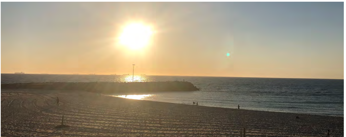
Cottesloe Beach sunset

f) To do all such things as they appear to the Club to be incidental or conducive to the attainment of the foregoing objectives or any of them.