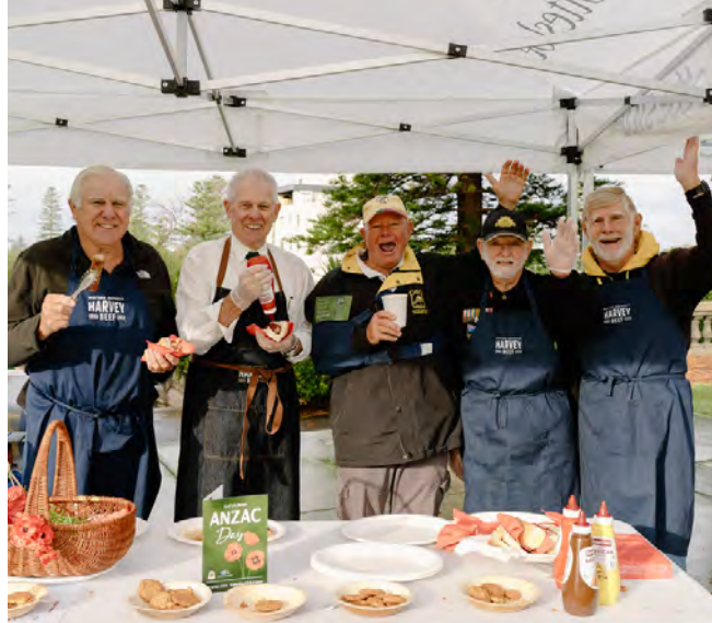
Vets ANZAC Day Service BBQ

From a maintenance area, we continued with the maintenance of the Honour Boards which involves purchasing the tags and ensuring the boards are updated so that the history of the Club is maintained. Working with the General Manager several smaller jobs were attended to, which allowed all members to have a good experience when attending the Club. This includes maintaining the minor issues in the change rooms, paint touch-up to various sections of the Club, maintaining the gate sand traps and ensuring the courtyard lawn and garden out the front are kept in a presentable manner. Over the years this has saved the Club considerable dollars. All this assists the management in keeping to a budget, fixing minor issues in a timely manner and still providing good facilities to its members. So, if you wish to give a little back to the Club which has provided superior training, much enjoyment and lifelong friendships over your active time at the Club, we invite you to become a member.