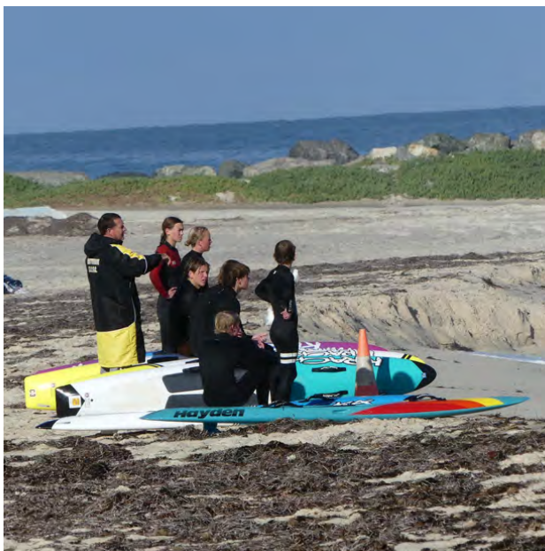
Winter board training

Every area of this club is involved on a Sunday morning and we continue to thank everyone for what they do to make Sundays run seamlessly.