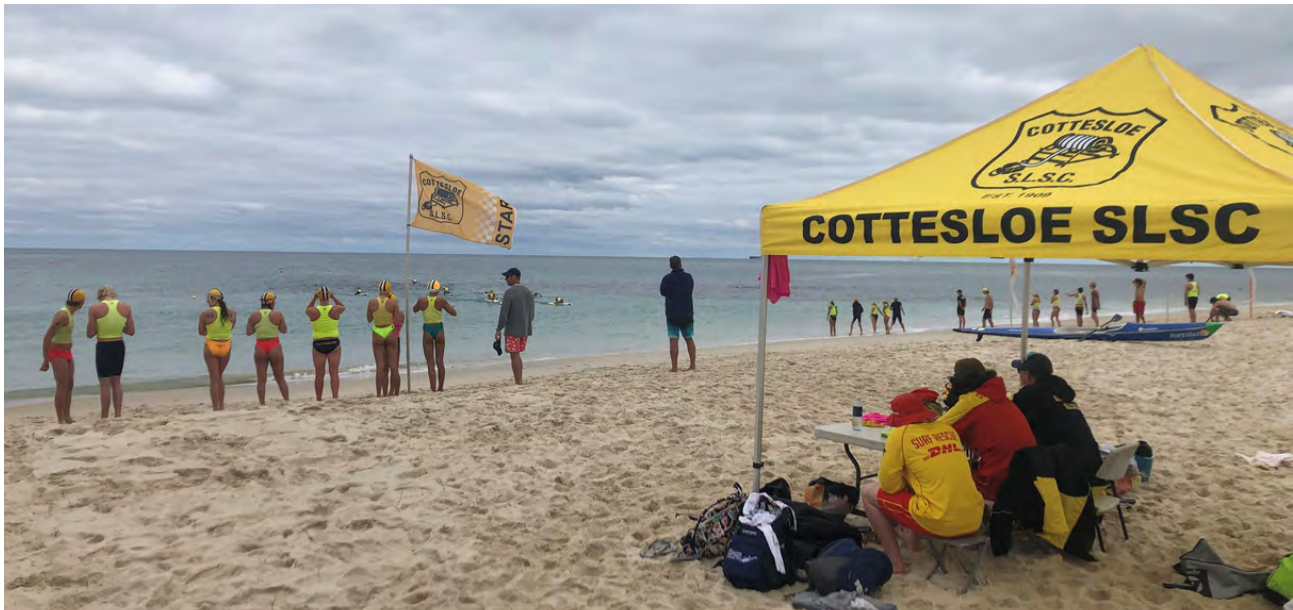
Sunday Surf Sports