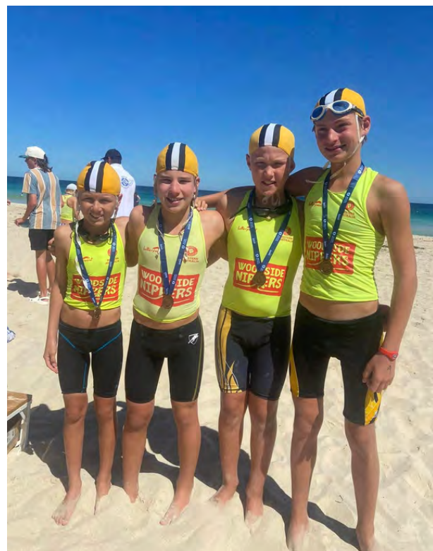
Nipper State Competitors

From a competitive position, it was great to see so many of our Cottesloe Woodside Nippers so well represented, again with some great results for the club. Thanks to all of the AGM's, coaches, parents, members and officials who assisted with carnival set-up, pack-down, marshalling, water safety and officiating.