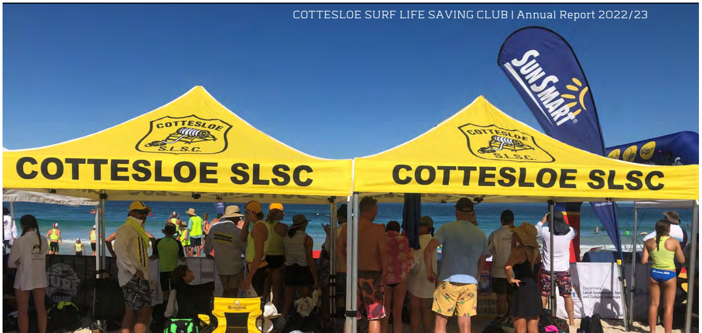
Cottesloe competition tents