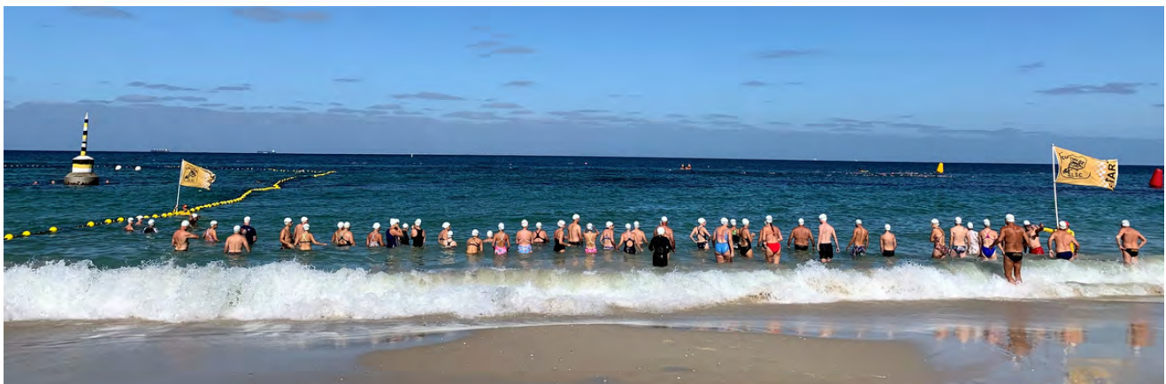
Cott Mile start line