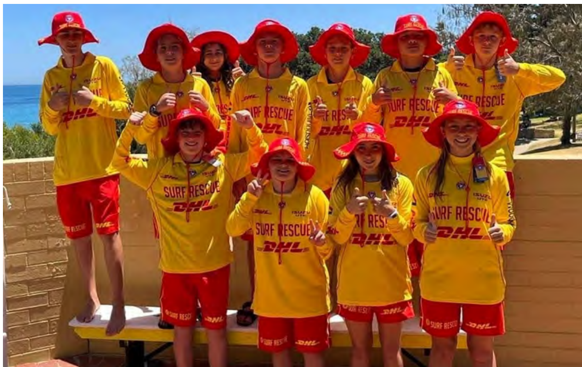
2022/23 Surf Rescue Certificate graduates