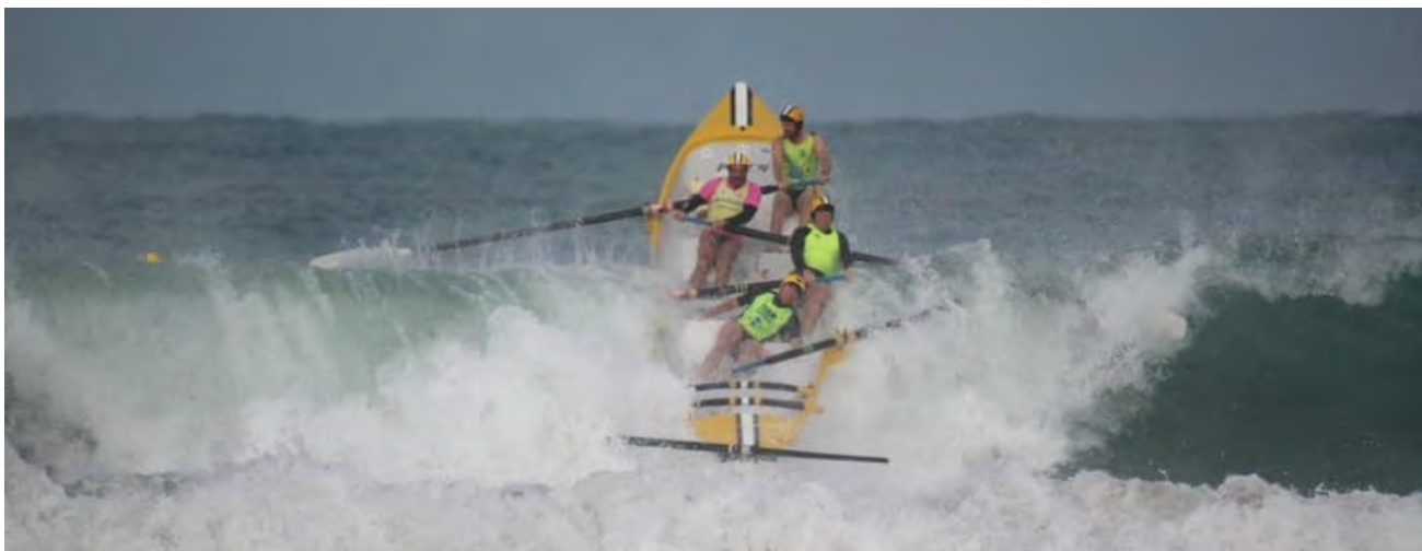
Geraldton surf carnival

May your future endeavors be graced with unmitigated success and an abiding sense of fulfillment.