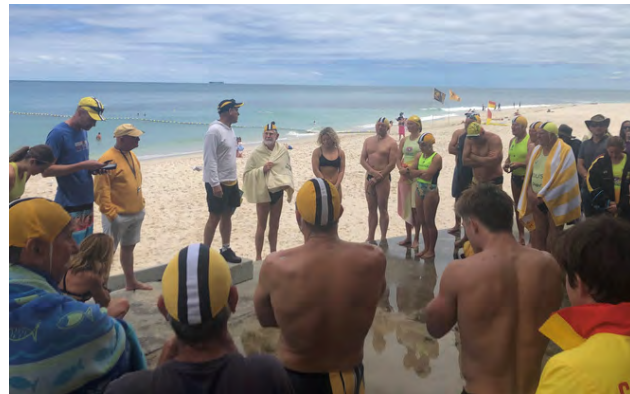
Club swim pre-race briefing

We have a great culture at Cottesloe around the club swim, which isn't the case at every club. It's a unique event that members from 12 to 80+ all take part in together so hopefully we can continue and build upon it next season.