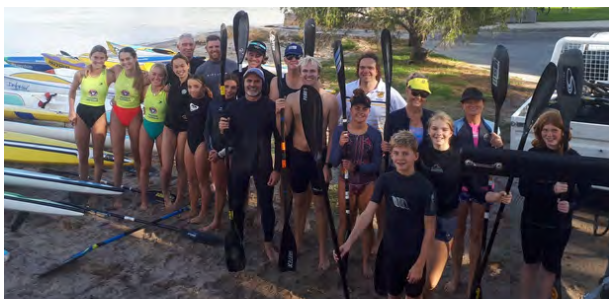
The Winter Wobblers

This season will see us climbing further up the results pages and again we will target key carnivals in particular States and Aussies in Queensland.