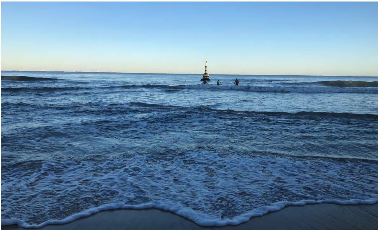
Cottesloe Beach Pylon