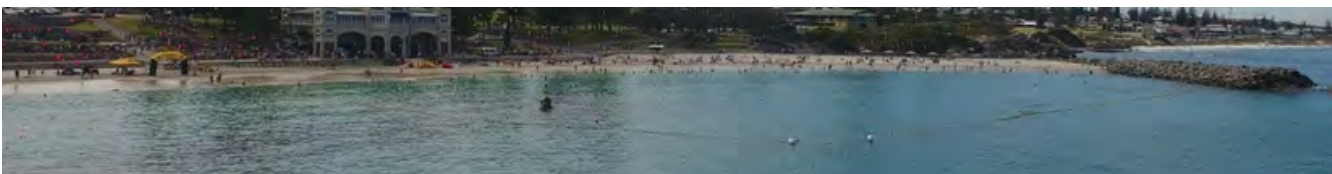
The Enclosed Swimming Area

From a lifesaving perspective, the Shark Barrier that surrounds our patrol area is mostly a blessing – as we can all do our laps without stressing if we are to be a meal for a passing predator – but we are kept on our toes, as there are many less than capable swimmers launching off for a swim to the net, only to realise it is further than it looks. It also goes without saying that we attract a lot of early morning swimmers, and in particular in the lead up to the Rottenest swim. This season we trialled an early morning surveillance patrol to be available for assistance as required. The early morning patrols are staffed by long-service members from 6am to 8am and we are grateful to the members who assisted with this venture. This was definitely well-received by the public and we hope to continue this practice next season, with the support of our long service members.