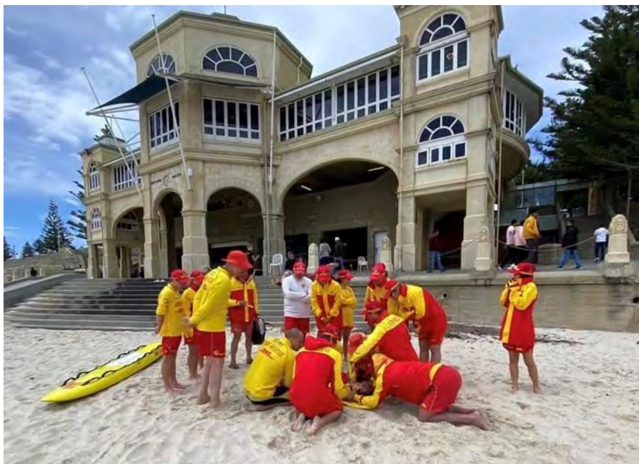
Member proficiency session