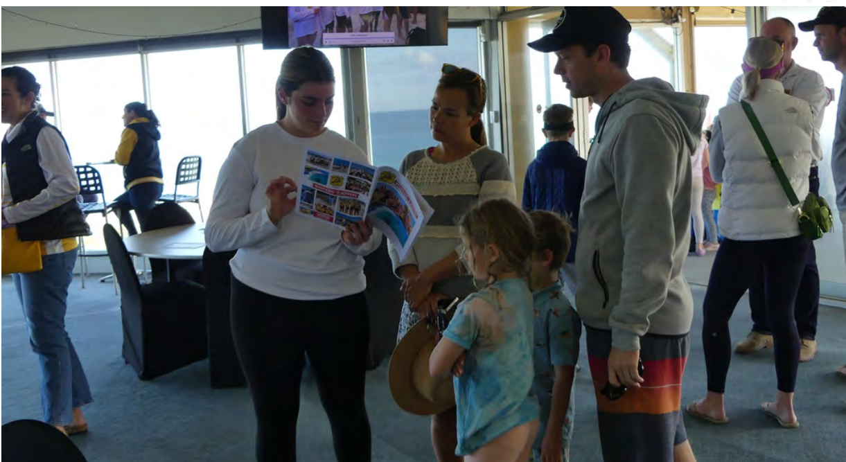
Open Day Registrations